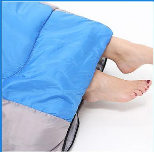
Bottom breathable design