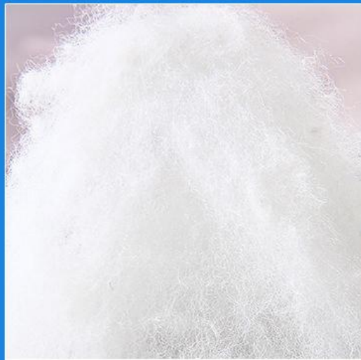
High quality hollow cotton