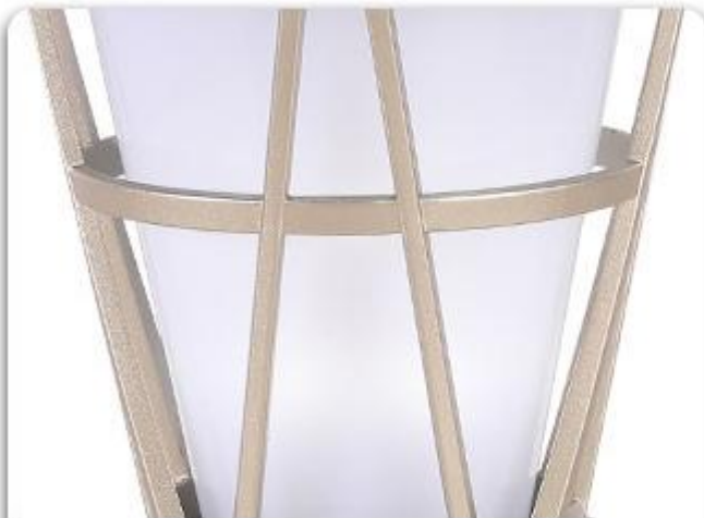
Geometric protective cover