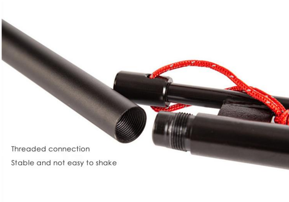
Threaded connection Stable and not easy to shake