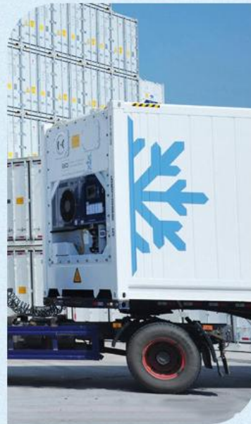
Cold chain transportation