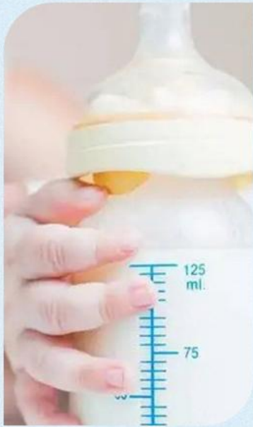
Breast milk preservation